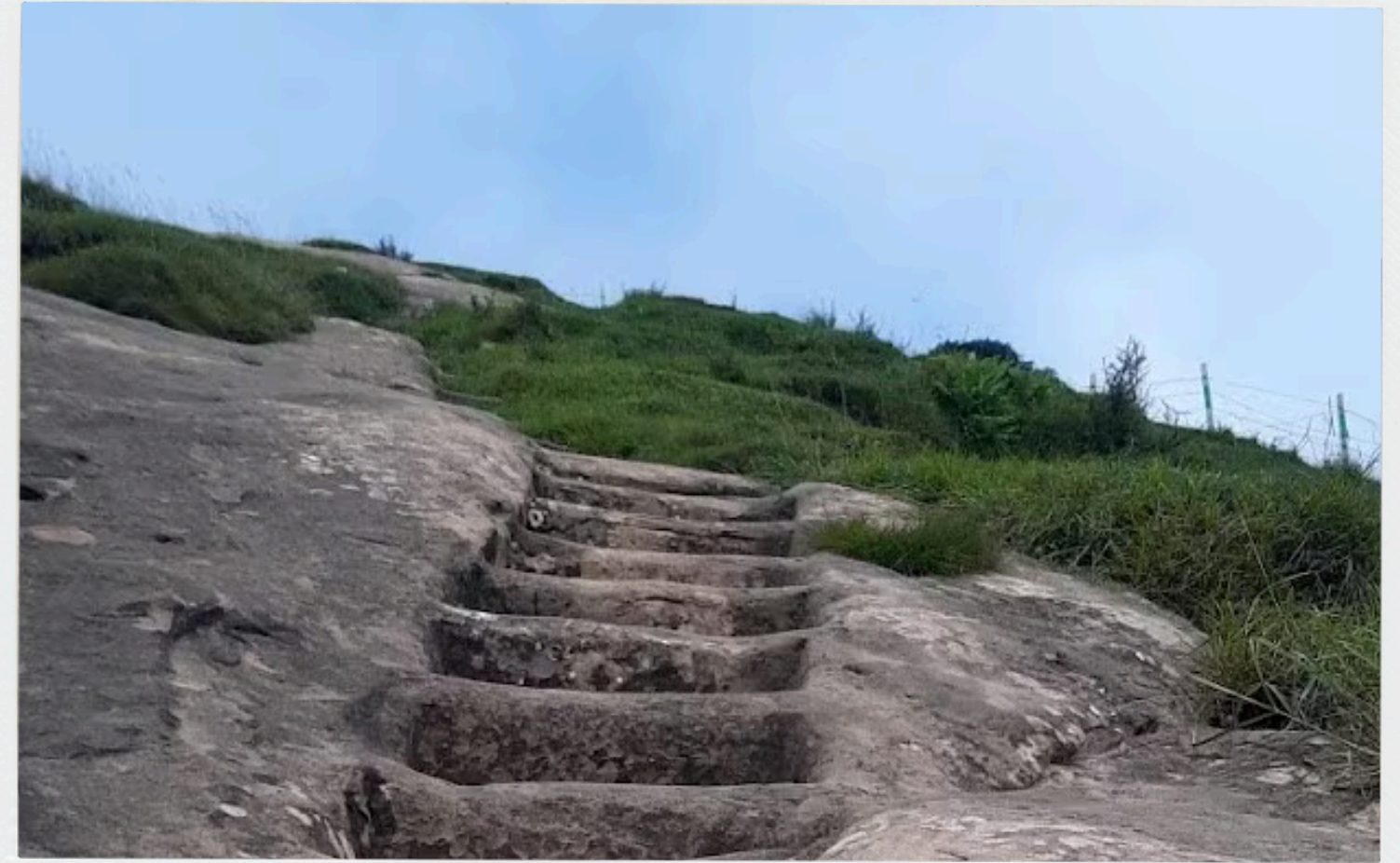
BILLO KI POWRI

Kud Park is a serene flower filled park located in the town of Kud, located on the Jammu Srinagar highway just before reaching Patnitop. Situated at roughly 1,850 meters (6,085 ft), it offers a cool climate, beautiful scenery and a popular spot to enjoy the famous local sweet, Patisa.